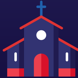
Places of Worship